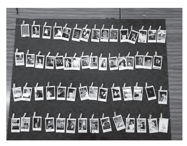
Dev Freet, 1973 Don't Forget Me, Photography