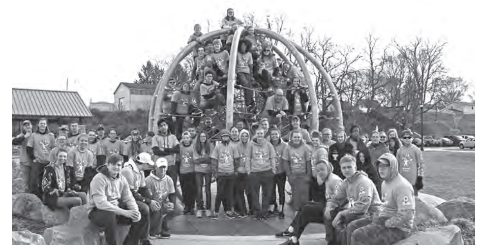
MHS and John Young students volunteer for Comcast Cares Day

Saturday, April 22, Mishawaka High School students took part in the Comcast Cares Day of Caring. Many groups from School City of Mishawka were present, but one of the largest was our Early College students! It was an exhausting 4 ½ hours of picking up trash, mulching and raking, but well worth it to help spread the spirt of volunteerism and service with our students!